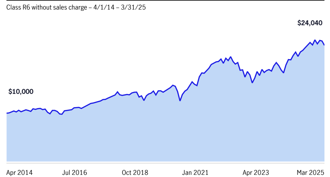
This chart illustrates the growth of a hypothetical $10,000 investment based on net asset value beginning on the date noted with all distributions reinvested. Performance data shown excludes fees and expenses. The performance data would be lower if such fees and expenses were included. Past performance does not guarantee future results. Returns for periods shorter than one year are cumulative.